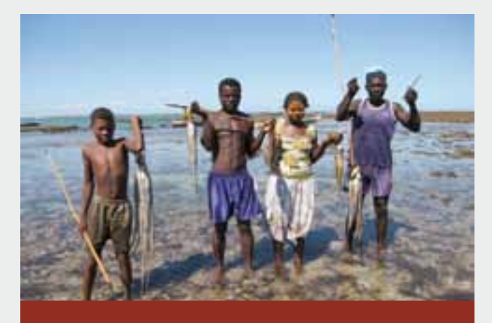
The world's fisheries employ approximately 200 million people, provide about 16% of the protein consumed worldwide and have a value estimated at US$ 82 billion.

Some estimated values of marine and coastal biodiversity