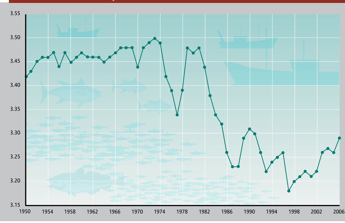
FIGURE 12 China's Marine Trophic Index

In some ocean fisheries, larger predators have been caught preferentially in such numbers that their stocks do not recover, and there has been a tendency for catches to become dominated by smaller fish and invertebrates, a phenomenon known as "fishing down the food web". In the long term, this compromises the capacity of marine ecosystems to provide for the needs of human communities.